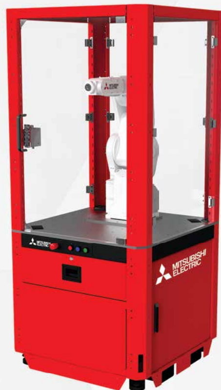
Machine Tending Robot Cell Intro Package starting at $49,900 Includes cage, cart, & RV-8CRL