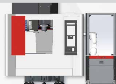
Tongtai VP-10 High Speed Vertical + RV-8CRL Package starting at $134,900