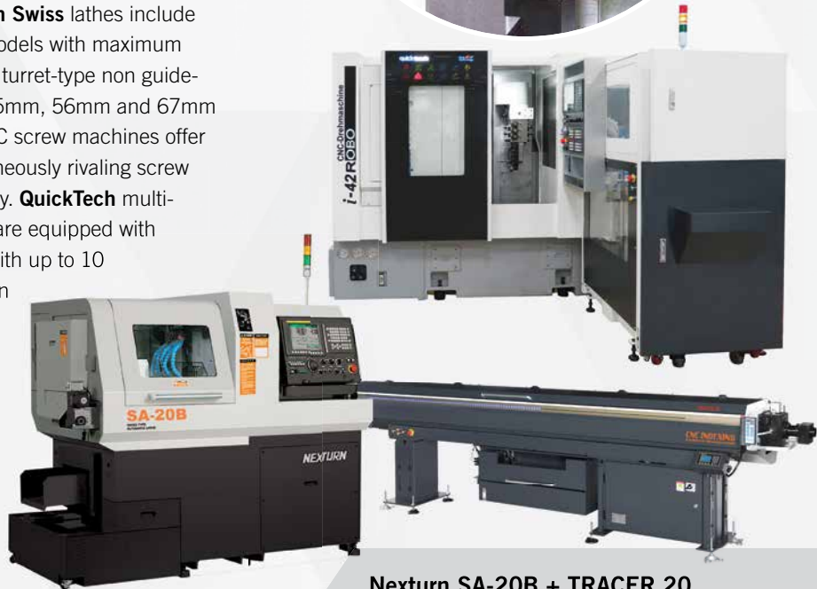
Nextturn SA-20B + TRACER 20 Bar Feeder Package = $129,900