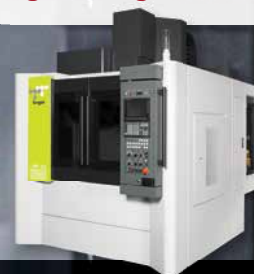
VP-10 Travel Specifications: 40.2"(x) x 20.1"(y) x 23.6"(z)